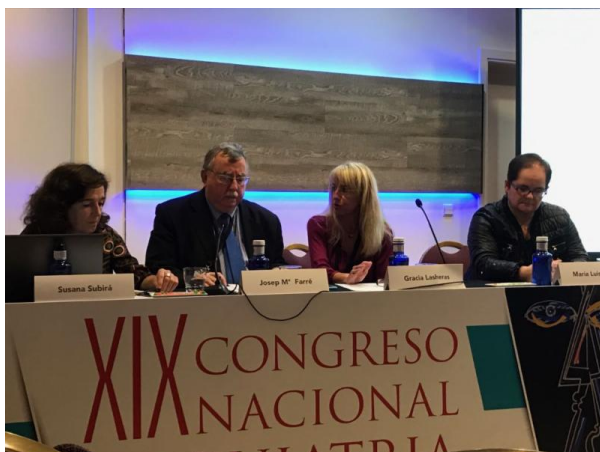
XIX Spanish National Congress of Psychiatry