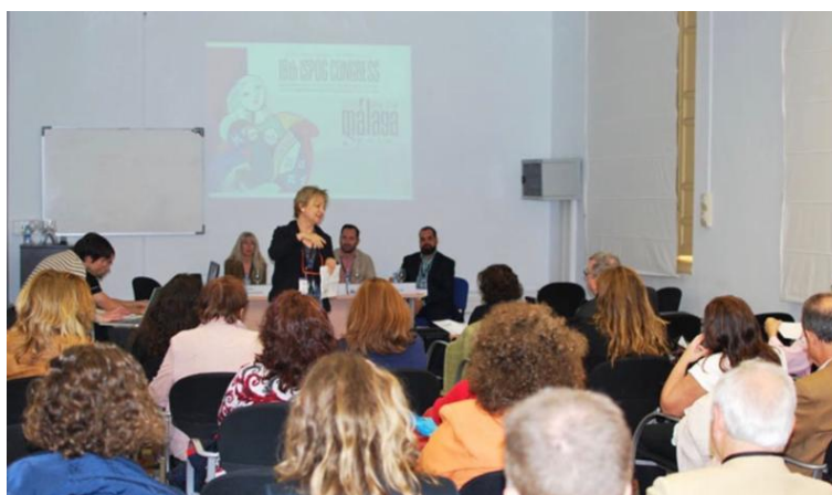
XI Alicia Koplowitz Foundation Scientific Conference